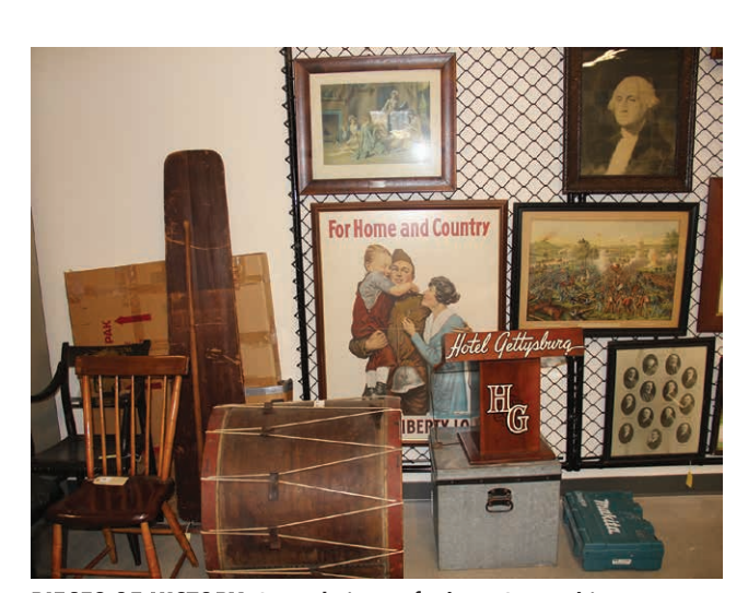
PIECES OF HISTORY: Several pieces of Adams County history are on hold in the new archive storage room, awaiting processing by archivists for the Adams County Historical Society.

Some of the stationary pieces in the museum include a