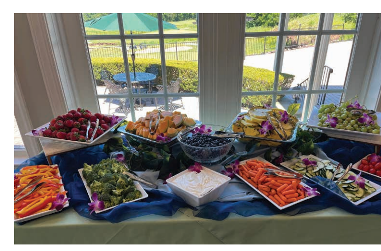
BIGGER SPREAD: Biggerstaff's Catering, LLC provides catering services for events big and small across Adams County, including cooperative events.

"When COVID-19 hit, things got rough," she says. "We were virtually shut down for a year, doing just a few things here and there on a very small scale. Luckily, we were able to