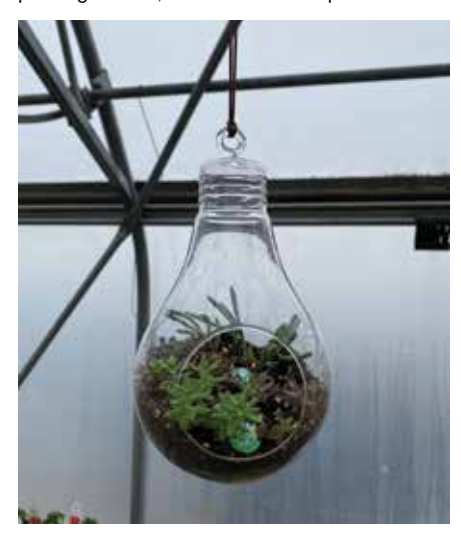
BRIGHT IDEA: Custom planting of unique planters is one of the specialties Roundtop Acres offers clients, and succulents like those above are very popular this season.

For greenhouse hours of operation, visit facebook.com/roundtopacres, and to purchase tickets for this year's garden tour, call 717-229-2633. Tickets must be bought in advance and before Iune 11. 🍪