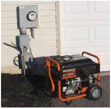
SAFE SWITCHING: Stand-by generators, like this Generac version, must always be used outside because of the carbon monoxide fumes they can produce. In addition, to avoid backfeeding power onto the electrical system, generators must be connected safely using a double-pole, double-throw transfer switch, which can be installed with assistance from Adams Electric Cooperative and a licensed electrician.

Adams Electric has been offering the optional SurgeHELP service plan to members since 2013. All claim questions and policy cancellation requests, however, go through HomeServe, which also sends the terms and conditions/welcome packet to new