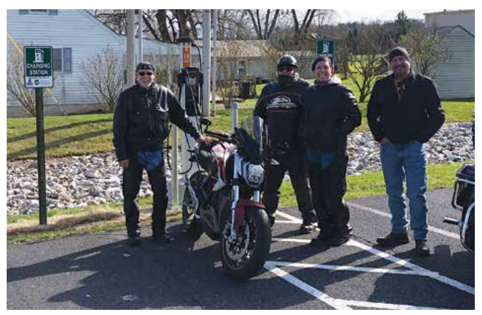
CHARGED UP: Motorcyclists passing through Gettysburg stop by the public electric vehicle charging station owned by Adams Energy Resources and Adams Electric at the Gettysburg District office along Biglerville Road.

Energy used for cooling and heating your home makes up the largest portion of your monthly energy bills. By combining regular equipment maintenance and upgrades with recommended insulation, air sealing and thermostat settings, you can save about 30% on your energy bills while helping our environment. Source: energy.gov