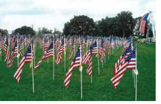
FIELD OF FLAGS: More than 350 volunteers will be descending on Southwestern School District's West Manheim Elementary School in September as 3,000 flags are constructed and erected in memory of the victims of 9/11, just 20 years ago. Shown above are flags from the 2016 event.

Because the flags cannot be raised and lowered appropriately to half-staff