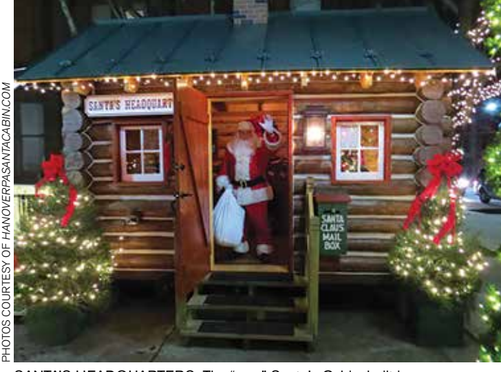
SANTA'S HEADQUARTERS: The "new" Santa's Cabin, built in 2018, was made possible through a donation from the Fraternal Order of Eagles No. 1406. The mailbox, sign and several other features were repurposed from the previous cabin.