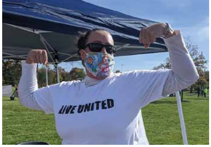
HELPING HANDS: For over 70 years, the Adams County branch of United Way has helped connect community members to health care, education and financial stability.

For more information about the United Way, the resources they have available and the ways in which you can become involved, visit uwadams.org .