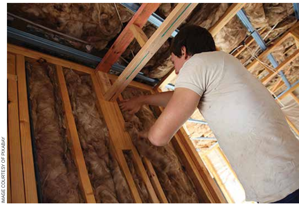
WALL TEST: People can visually inspects their home's insulation to ensure proper placement of insulation. The home will more efficiently retain heat during the fall and winter if the entirety of the surface area is covered. Contrary to the photo, insulation is typically covered by a layer of drywall.

Cold drafts – Do you constantly notice that there is cold air coming from a particular area of your