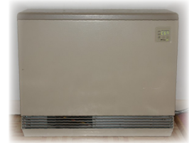
Electric thermal storage unit

For more information, call Adams Electric toll-free at 1-888-232-6732.